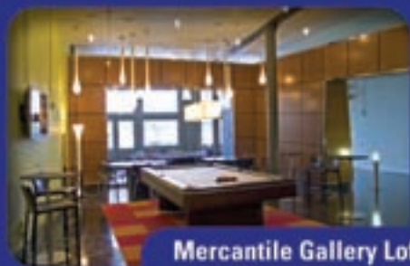
Mercantile Gallery Lofts