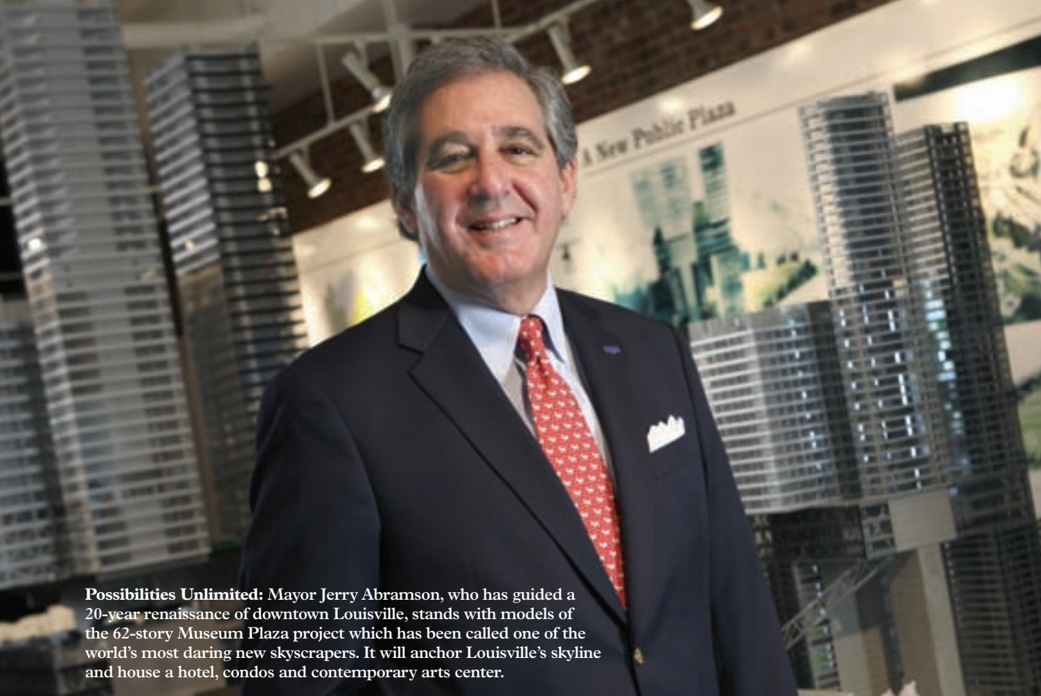
Possibilities Unlimited: Mayor Jerry Abramson, who has guided a 20-year renaissance of downtown Louisville, stands with models of the 62-story Museum Plaza project which has been called one of the world's most daring new skyscrapers. It will anchor Louisville's skyline and house a hotel, condos and contemporary arts center.