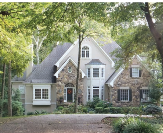
Oldham County residential areas range from traditional small town neighborhoods and homes 100 years old to current construction with every modern convenience and feature.

to the Oldham County Historical Society, several city parks and public schools. Beyond Main Street is a thriving business district and familiar names such as Walmart, Kroger, Applebees and Beef o'Bradys. Great Escape, an 8-plex movie theater in Oldham County, is located in La Grange as well. (See the La Grange article on Page 5)