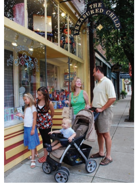
The historic central Main Street in downtown La Grange is busy with activity at a mix of long-time and new local businesses. A recent Main Street Program economic development initiative filled the storefronts that were available.

James Beaumont Community Center houses City Hall and recreational opportunities, including an indoor walking track,