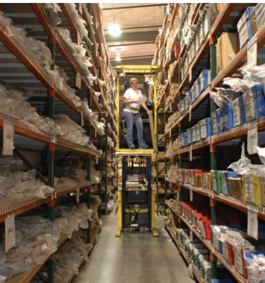
Parts Unlimited ships the muscle car restoration replacement parts it manufactures to retailers all over the United States.

Rocket Man: Rocket Man is a leading provider of vendor management services for sports and entertainment venues, including the Kentucky Derby, the Olympic Games and the Super Bowl. In addition, Rocket Man Equipment Co. is the leading producer of backpack beverage dispensing equipment with sales in more than 50 countries.