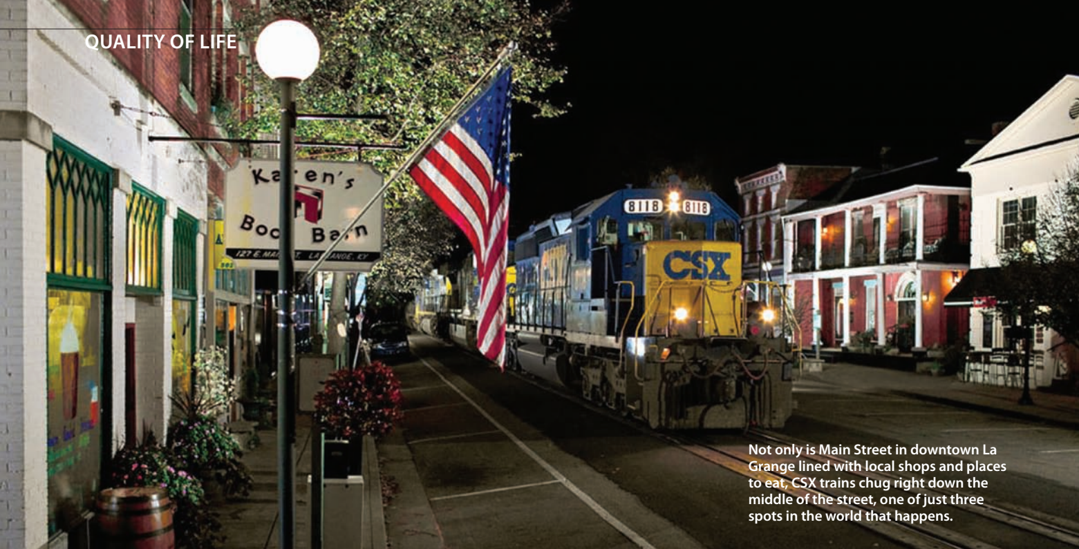
Not only is Main Street in downtown La Grange lined with local shops and places to eat, CSX trains chug right down the middle of the street, one of just three spots in the world that happens.