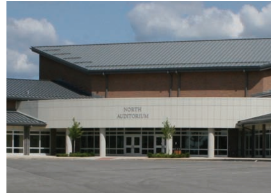
Three in four graduates go on to college or other post-secondary education and training from Oldham County Schools, the top rated public system in Kentucky.

Unique to the Oldham County public school system are the Arvin Education Center and the Oldham County Schools Art Center. All high school students can earn post-secondary credits at the Arvin Center in four cluster areas: Automotive; Culinary Arts; Health Sciences; and Information Technology. The Arts Center provides all students the opportunity to take visual art, music, dance and theater classes in a spacious facility including a performance hall, resource center and adult education programs.