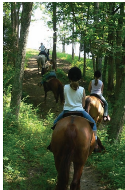
Oldham County offers riding opportunities from the most casual to FEI level training facilities.

Prospect is one the few cities in Kentucky that actually crosses county lines and is known for spacious homes, luxurious condominiums and a quaint shopping village