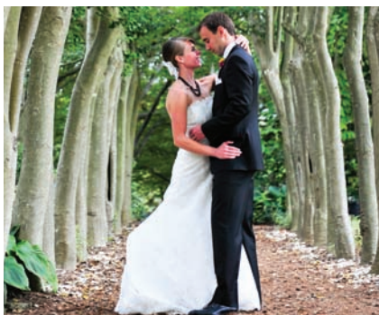
Yew Dell Gardens in Crestwood is one of Horticulture magazine's top 10 national destinations. It's a very popular location for local events.