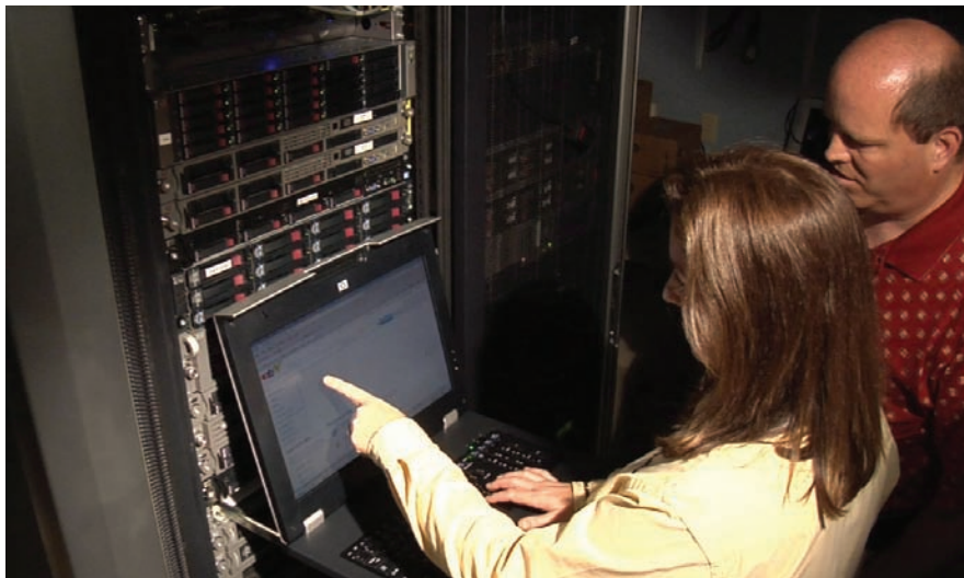
Fastline Publications employees prepare another of their speciality magazines for the agriculture and trucking markets. They also serve South American markets.

Carriage House: Carriage House is a division of Ralcorp Inc. The local facility manufactures syrups and salsas, and is adding a new production line for peanut butter. It is a major supplier for discount stores all across the country like Walmart and Kmart.