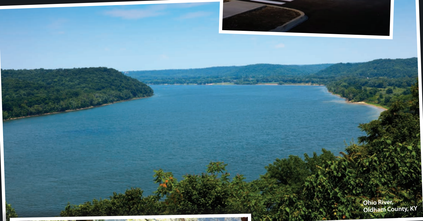
Ohio River, Oldham County, KY