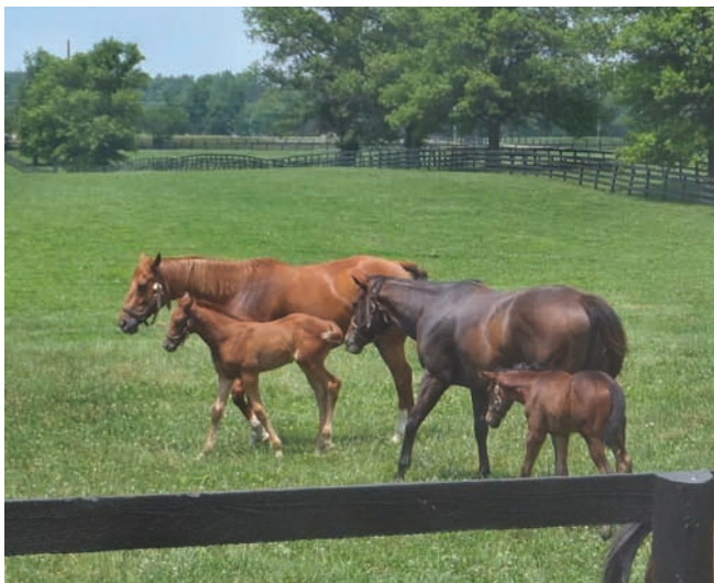
Oldham County has a deeply ingrained equine history that has produced a Kentucky Derby winner and a visit by Queen Elizabeth II.

O LDHAM County has a rich equine history that continues today, including the themed 5,400-acre L'Esprit equestrian community with homesteads of from 5 to more than 100 acres.