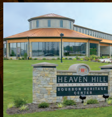
Heaven Hill Distillery opened in Bardstown, Ky., shortly after Prohibition. It is now the seventh largest spirits supplier in the United States.