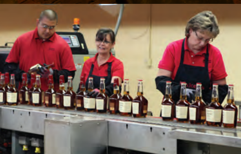
Maker's Mark bottles, topped with their trademarked red wax, are transported down an assembly line at the distillery in Loretto, Ky.