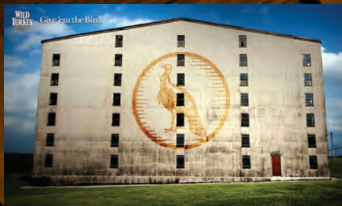
Gruppo Campari in September celebrated the grand opening of a $43 million packaging facility at the Wild Turkey Distillery in Lawrenceburg, Ky. Wild Turkey's Barrel House is shown above