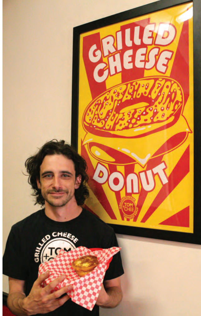
Tom + Chee offers creative selections of grilled cheese, including the Grippio's BBQ + Bacon, the Bacon + Blue, the Grilled Mac + Cheese, and the Grilled Cheese Donut, as well as homemade soups and fresh salads.

sandwiches on the menu (plus the option to build your own), the only limitation you have on your palette is your own imagination.