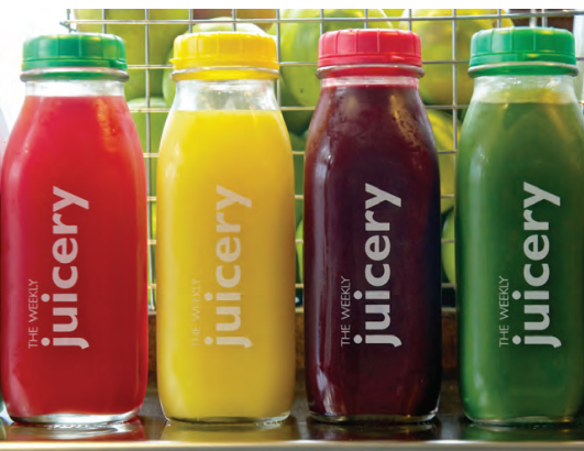
The Weekly Juicery uses a Norwalk cold press to produce high-quality, nutrient-rich juice. The juices are pressed through the night, bottled in glass bottles and ready in the cooler or for delivery each morning.

Learn more about LIFEbar by visiting lifebarlouisville.com . Contact The Weekly Juicery by calling (859) 368-8000.