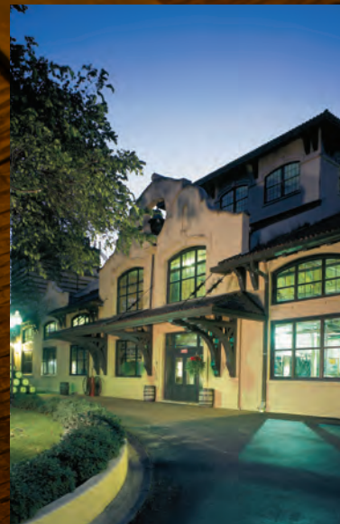
Four Roses opened its 5,000-s.f. visitors center and gift shop late last year, part of a $2.4 million expansion of the Lawrenceburg distillery property.