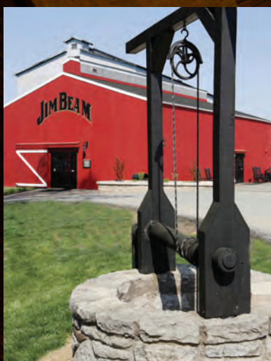
Jim Beam in Clermont, Ky., recently opened American Stillhouse, a new visitors center. The building is a replica of a 1940s stillhouse, along with the staircase from the original historic stillhouse.