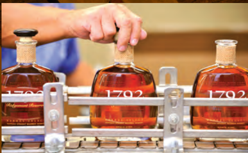
Barton 1792 Distillery operates on the Bardstown site of the historic Tom Moore Distillery, established in 1879 near the Tom Moore Spring, the same spring from which Barton draws its iron-free limestone water today. The 192-acre distillery is home to many historic buildings, including the stillhouse and 28 aging warehouses.