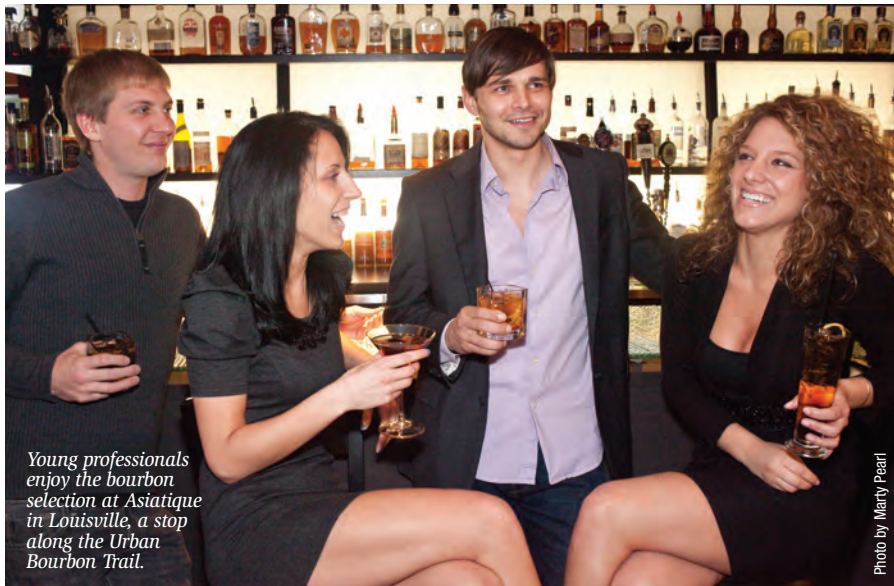
Young professionals enjoy the bourbon selection at Asiatique in Louisville, a stop along the Urban Bourbon Trail.