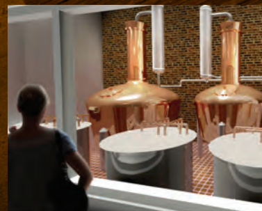
Heaven Hill's Evan Williams Experience, a multimillion-dollar tourist attraction, is set to open this fall in downtown Louisville. Located on historic Whiskey Row, the new attraction celebrates the legacy of Evan Williams, Kentucky's first distiller and namesake of Heaven Hill's flagship bourbon brand. Above, an artist's rendering depicts the artisanal distillery inside the Louisville attraction.