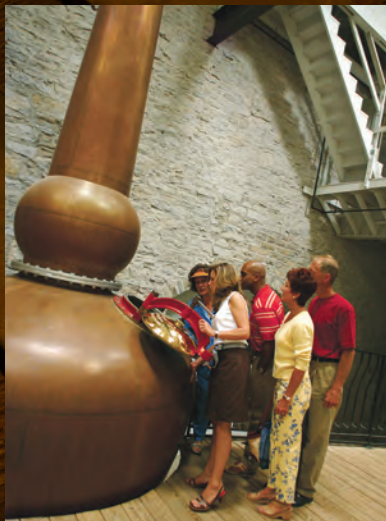
A tour group learns how the copper pot stills work at Woodford Reserve Distillery.