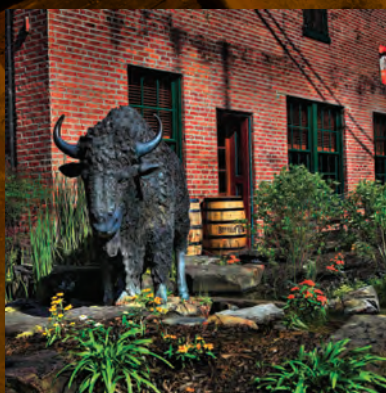
Buffalo Trace in Frankfort, Ky., is the oldest continually operating distillery in the country. There has been distillation there since 1775. It even distilled bourbon during Prohibition, when a special permit was granted for Buffalo Trace to produce bourbon for "medicinal purposes."