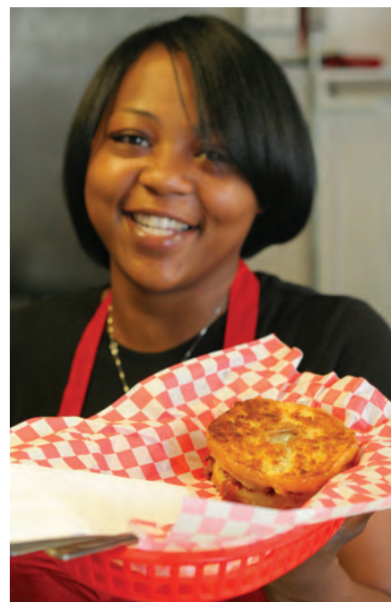
Tom + Chee is a gourmet grilled cheese and tomato soup shop located in downtown Cincinnati, Louisville, Ky., and Newport, Ky. A shop is opening soon in Lexington.

Having been to this neighborhood spot more than a dozen times solo, I've made a personal vow: try something different every time. With more than two dozen fancy grilled cheese