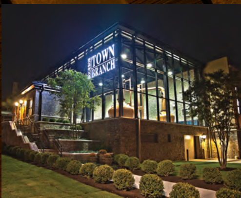
Alltech's Town Branch Distillery is located in the heart of downtown Lexington. Late last year, the distillery was added as a stop on the Kentucky Bourbon Trail.