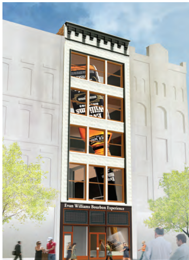
Heaven Hill Distilleries' new Evan Williams Bourbon Experience, shown here in this artist's rendering, has been named the eighth stop on the Kentucky Bourbon Trail. It is scheduled to open this fall.

distilleries dotting the countryside, and bed and breakfasts catering to travelers from far and wide. Estimates from the recent KDA research indicate that, for each 1,000 completions of the Bourbon Trail, these adventurers spent $585,000 in the region (divided among food and beverage, retail shopping and gas, as well as hotels and B&Bs).