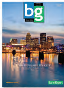
GREATER LOUISVILLE EDITION