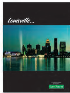
GREATER LOUISVILLE & SOUTHERN INDIANA