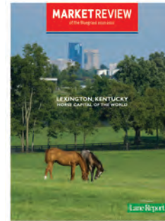
(1) With three or more ads in The Lane Report (2) Horizontal Only