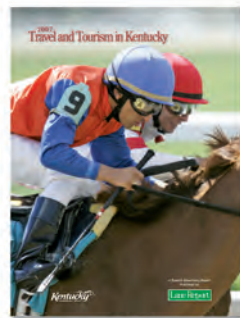
TRAVEL AND TOURISM IN KENTUCKY

Lane Communications Group can publish a special report for your business or community